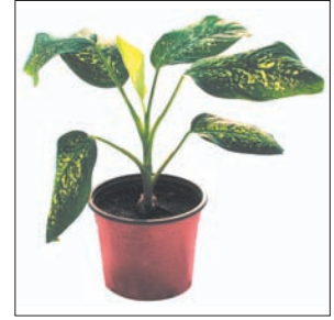
Dieffenbachia camilla (Sugar Cane) EUR 7.00 Code 016.600.200.000 (25x25x50 cm)