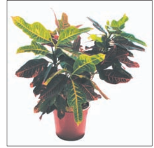
Codieum EUR 10.00 Code 016.600.310.000 (60x60x90 cm)