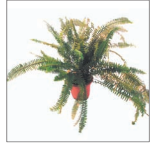
Pteridophyta (Bracken) EUR 7.00 Code 016.600.070.000 (50x50x70 cm)