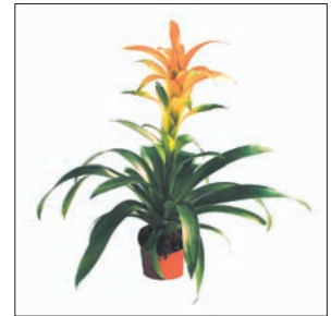
Guzmania Hilda EUR 10.00 Code 016.600.230.000 (25x25x80 cm)