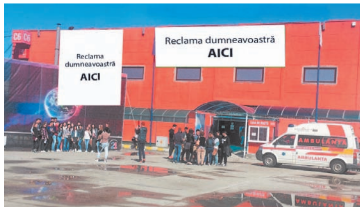
BANNER DISPLAY ON PAVILION C6 FACADE