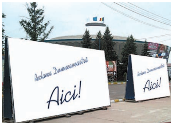
BANNER DISPLAY ON MOBILE PLATFORMS