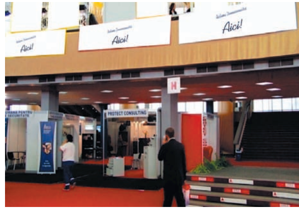
BANNER DISPLAY ON PAVILION A, FRIEZE 4.50