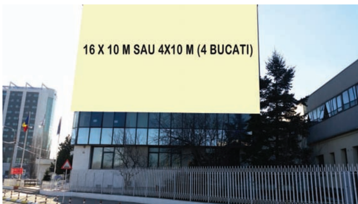
BANNER DISPLAY ON ROMEXPO HEADQUARTER FACADE