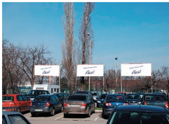
BANNER DISPLAY AT PARKING-GATE B