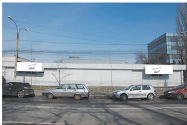
BANNER DISPLAY ON ROMEXPO HEADQUARTER FACADE