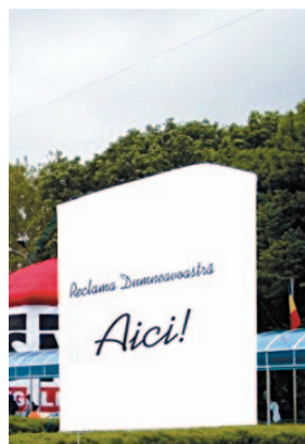
ADVERTISING MASCOTS DISPLAY