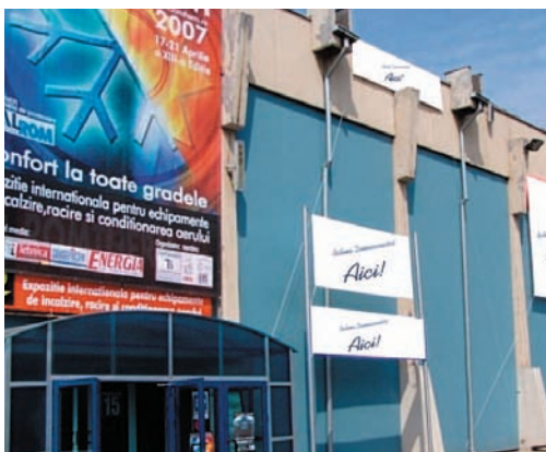
BANNER DISPLAY ON PAVILION C1 FACADE