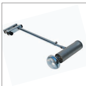
Lampa spot cu brat 100W EUR 12.00 Cod 019.010.181.000