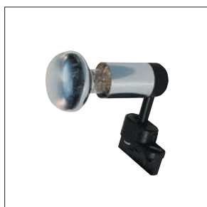
Lampa spot 100W EUR 12.00 Cod 019.010.188.000