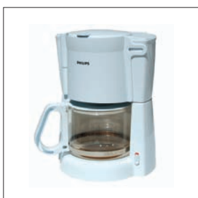
Filtru de cafea EUR 4.00 Cod 025.010.120.010