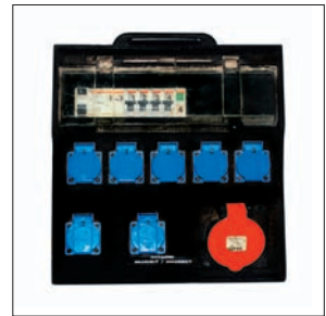
Panou Electric 380V/220V EUR 100.00 Cod 019.010.265.000