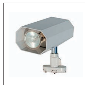
Spot halogen SY STAR 50W(A) EUR 15.00 Cod 019.010.186.000