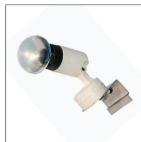
Lampa spot SS30 100W EUR 12.00 Cod 019.010.200.008