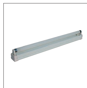
Corp fluorescent tip SS30 cu un tub D-170 - A EUR 18.00 Cod 019.010.190.001