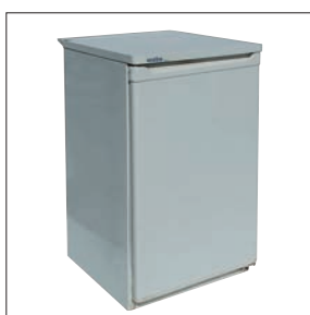
Frigider ARCTIC (180 l) EUR 44.00 Cod 025 010 070 020