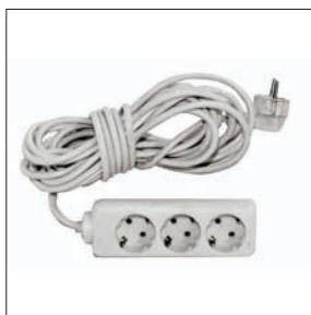
Prelungitor 230V, 10A, 5m EUR 10.00 Cod 019.010.279.000