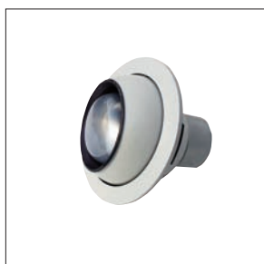
Lampa spot 100W EUR 12.00 Cod 019.010.170.000