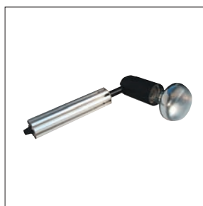
Lampa spot stut OCTANORM EUR 12.00 Cod 019.010.187.000