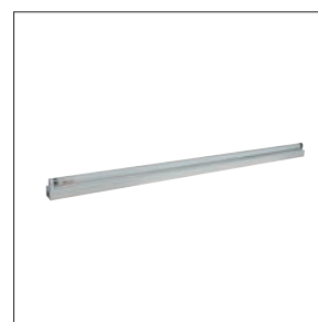
Lampa fluorescenta FIA EUR 15.00 cu instalatie electrica completa 1x40W Cod 019.010.110.000