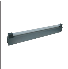
Corp fluorescent tip SS30 EUR 15.00 cu un tub D-170 Cod 019.010.190.000