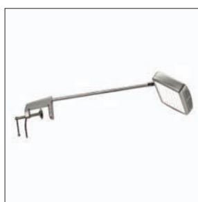
Reflector tija LED A++ EUR 35.00 16W 1100LM 4000K ARM33CM Cod 019.010.200.040