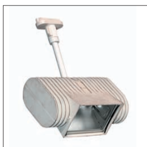
Reflector halogen SYMA STAR 300W EUR 35.00 Cod 019.010.200.006