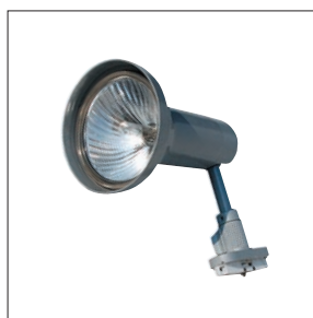
Spot halogen SY STAR 100W EUR 15.00 Cod 019.010.185.000