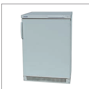
Frigider 125 FB EUR 24.00 Cod 025 010 070 031