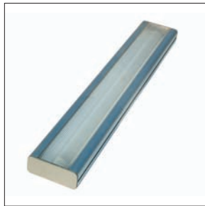
Corp fluorescent tip SYMA STAR EUR 18.00 Cod 019.010.200.001