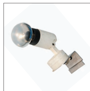
Lampa spot SS30 100W EUR 12.00 Cod 019.010.200.008