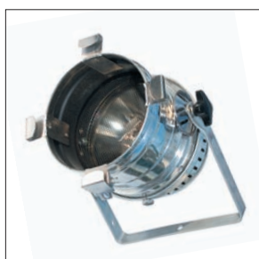
Reflector PAR64 500-1000W EUR 40.00 Cod 019.010.200.020