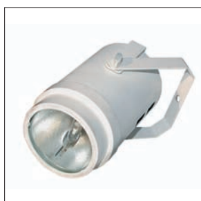
Reflector HQI 80W EUR 35.00 Cod 019.010.200.030