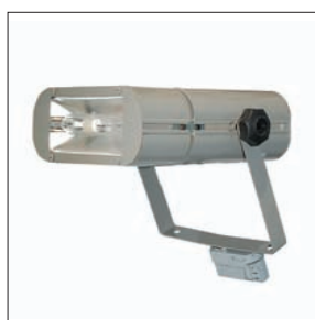
Reflector IVEN HQI 150W EUR 35.00 Cod 019.010.200.005