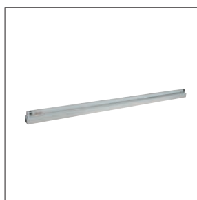
Lampa fluorescenta FIA cu instalatie electrica completa 1x 40W EUR 15.00 Cod 019.010.110.000