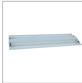
Corp fluorescent tip OCTANORM EUR 20.00 cu doua tuburi D-171 Cod 019.010.200.000