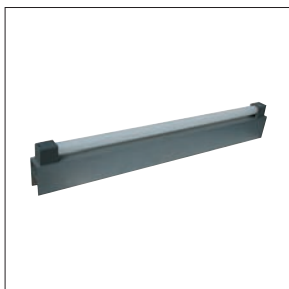
Corp fluorescent tip SS30 EUR 15.00 cu un tub D-170 Cod 019.010.190.000