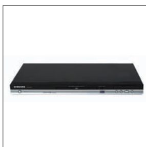
DVD Player EUR 40.00 Cod 025 010 130 030