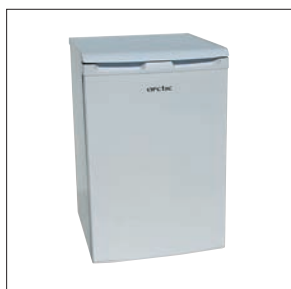
Racitor (140 l) EUR 24.00 Cod 025 010 070 010 (55 x 61 x 84 cm)