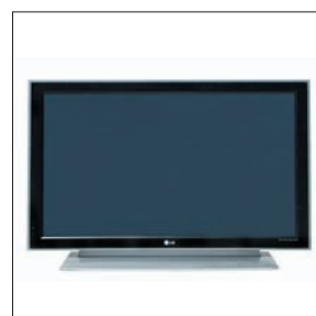
TV Plasma EUR 25.00/zi Cod 025 010 130 040