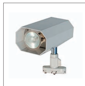
Spot halogen SY STAR 50W(A) EUR 15.00 Cod 019.010.186.000