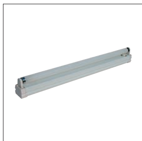
Corp fluorescent tip SS30 EUR 18.00 cu un tub D-170 - A Cod 019.010.190.001