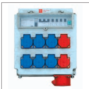
Panou Electric OCTANORM EUR 120.00 Cod 019.010.275.000