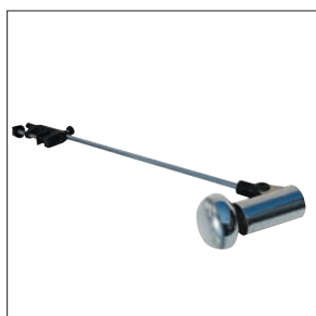
Lampa spot cu brat EUR 12.00 Cod 019.010.180.000