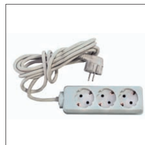
Prelungitor 230V, 10A, 3m EUR 10.00 Cod 019.010.277.000