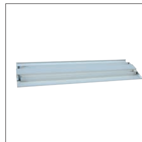
Corp fluorescent tip OCTANORM EUR 20.00 cu doua tuburi D-171 Cod 019.010.200.000