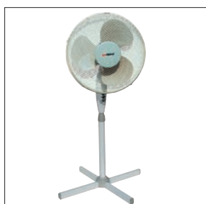
Ventilator cu picior EUR 7.00 Cod 025.010.500.020