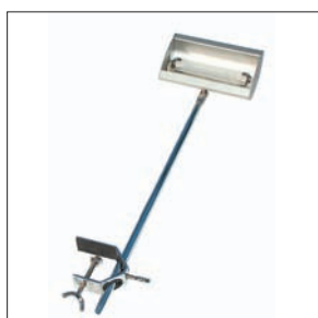
Reflector cu brat 300W EUR 35.00 Cod 019.010.200.010