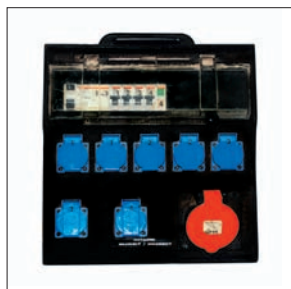
Panou Electric 380V/220V EUR 100.00 Cod 019.010.265.000