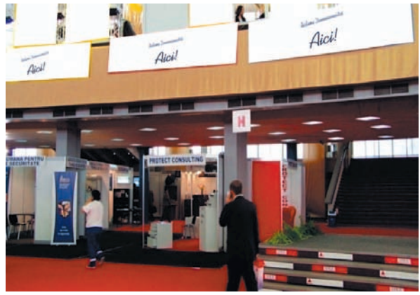
BANNER DISPLAY ON PAVILION A, FRIEZE 4.50