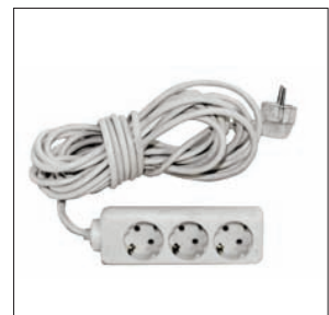
Extension cable 230V, 10A, 5m EUR 18.00 Code 019.010.279.000