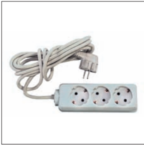
Extension cable, 230 V, 10A, 3m EUR 18.00 Code: 019.010.277.000