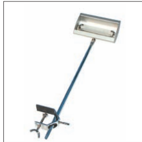
Arm reflector 300W EUR 50.00 Code 019.010.200.010