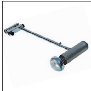
Arm spotlight 100W EUR 21.00 Code 019.010.181.000