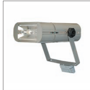
IVEN HQI 150W reflector EUR 50.00 Code 019.010.200.005