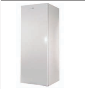
Refrigerator ARCTIC 255I EUR 80.00 Code: 025.010.029.199