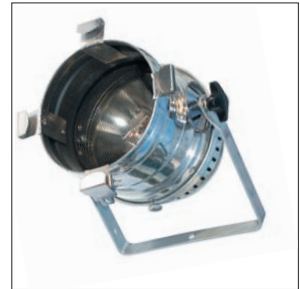
PAR64 500-1000W reflector EUR 55.00 Code 019.010.200.020