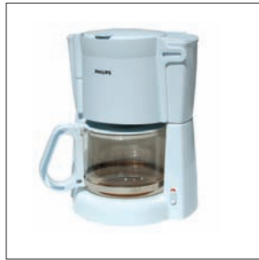
Coffee maker EUR 10.00 Code 025.010.120.010