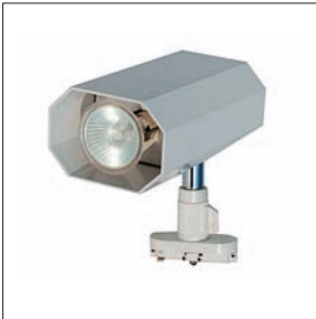
Halogen spotlight 100W SY STAR 50W (A) EUR 24.00 Code 019.010.186.000