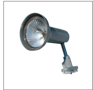
Halogen spotlight SY STAR EUR 24 cod 019.010.185.000