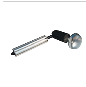
Connecting spotlight OCTANORM EUR 21.00 Code 019.010.187.000