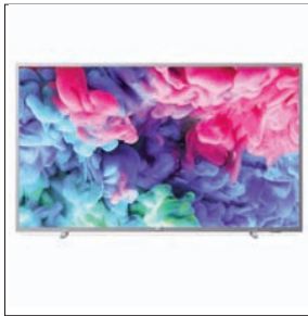
TV LED SMART 4K, UHD ultrathin EUR 55.00/day (diagonal screen: 126 cm) Code 025 010 130 045