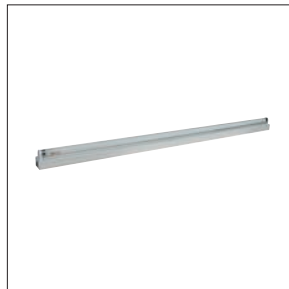
Fluorescent lamp FIA with complete electric installation 1x40W EUR 24.00 Code 019.010.110.000