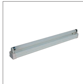
Fluorescent lighting SS30 type with D-170-A tube EUR 27.00 Code 019.010.190.001