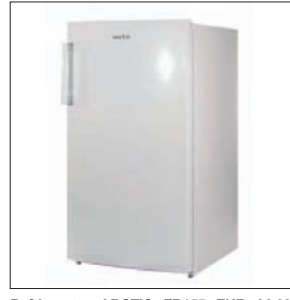
Refrigerator ARCTIC FB155 EUR 36.00 Code: 025.010.020.198