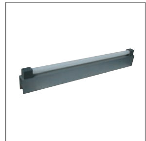
Fluorescent lighting SS30 type with D-170 tube EUR 24.00 Code 019.010.190.000