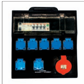
Electrical panel 380V/220V EUR 210.00 Code 019.010.265.000