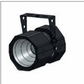
LED VIRGO reflector 40W 4350 LM 4100 K EUR 55.00 Code 019.010.200.045