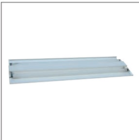
Fluorescent lighting OCTANORM type with double-tube D-171 EUR 29.00 Code 019.010.200.000