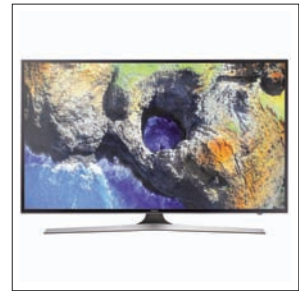
TV SAMSUNG UHD EUR 85.00/day (diagonal screen: 163 cm) Code 025 010 130 047