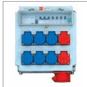
Electrical panel Ocanorm EUR 210.00 Code 019.010.275.000