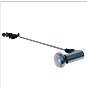
Arm spotlight EUR 21.00 Code 019.010.180.000