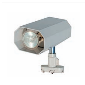
Spot halogen SY STAR 50W(A) EUR 24.00 Cod 019.010.186.000