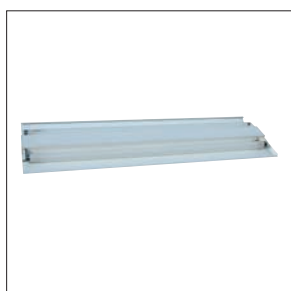
Corp fluorescent tip OCTANORM EUR 29.00 cu doua tuburi D-171 Cod 019.010.200.000