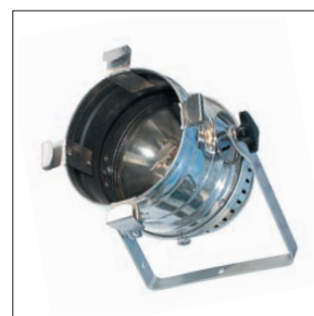
Reflector PAR64 500-1000W EUR 55.00 Cod 019.010.200.020