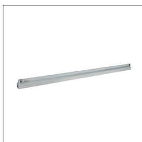
Lampa fluorescenta FIA EUR 24.00 cu instalatie electrica completa 1x40W Cod 019.010.110.000