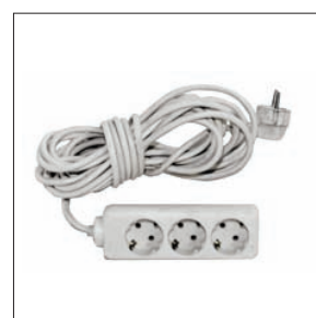
Prelungitor 230V, 10A, 5m EUR 18.00 Cod 019.010.279.000