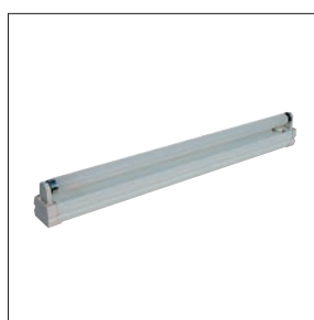
Corp fluorescent tip SS30 EUR 27.00 cu un tub D-170 - A Cod 019.010.190.001