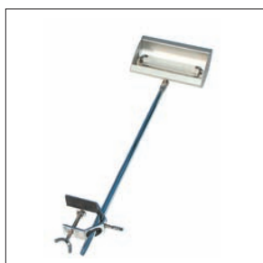
Reflector cu brat 300W EUR 50.00 Cod 019.010.200.010