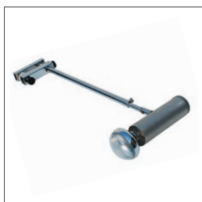
Lampa spot cu brat 100W EUR 21.00 Cod 019.010.181.000