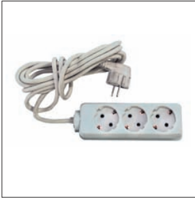
Prelungitor 230V, 10A, 3m EUR 18.00 Cod 019.010.277.000