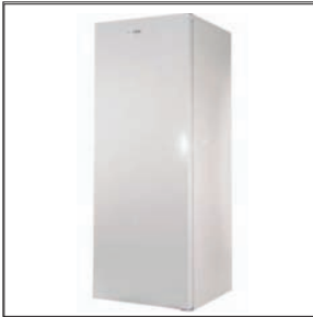
Frigider ARCTIC 255 l EUR 80.00 Cod 025 010 020 199