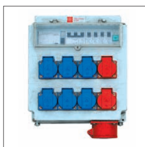
Panou Electric OCTANORM EUR 210.00 Cod 019.010.275.000