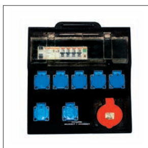
Panou Electric 380V/220V EUR 210.00 Cod 019.010.265.000