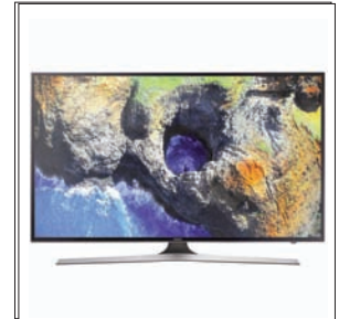
TV SAMSUNG UHD EUR 85.00/day (diagonal screen: 163 cm) Code 025 010 130 047