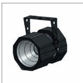
Reflector LED VIRGO EUR 55.00 40W 4350 LM 4100 K Cod 019.010.200.045