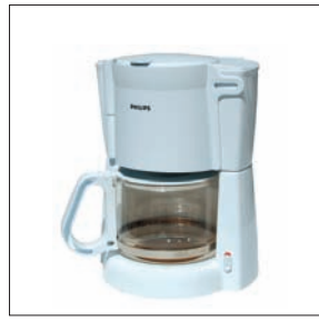
Filtru de cafea EUR 10.00 Cod 025.010.120.010