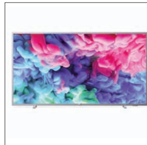
TV LED SMART 4K, EUR 55.00/zi UHD ultrasubtire (diagonala ecran: 126 cm) Cod 025 010 130 045