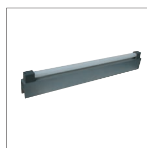
Corp fluorescent tip SS30 EUR 24.00 cu un tub D-170 Cod 019.010.190.000