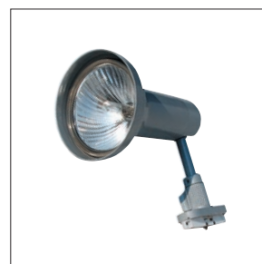
Spot halogen 100W EUR 24.00 SY STAR Cod 019.010.185.000