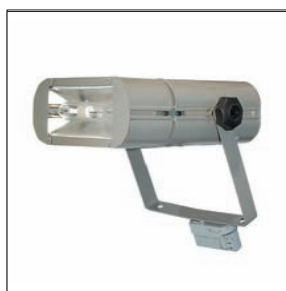
Reflector IVEN HQI 150W EUR 50.00 Cod 019.010.200.005