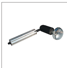
Lampa spot stut OCTANORM EUR 21.00 Cod 019.010.187.000