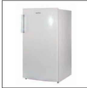
Frigider ARCTIC FB 155 EUR 36.00 Cod 025 010 020 198